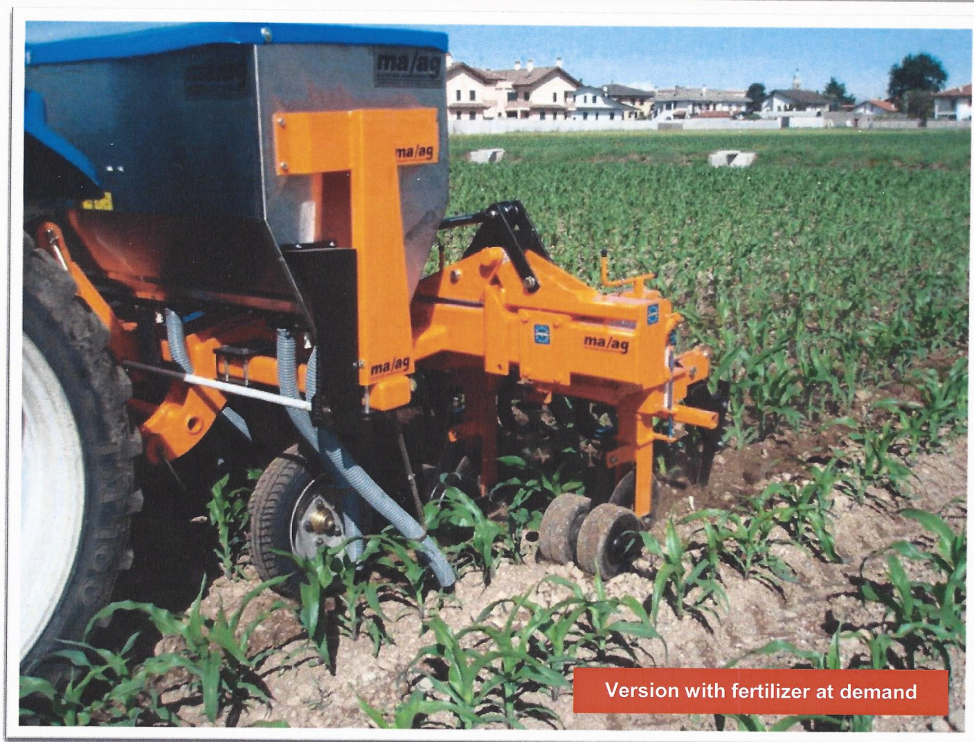
Version with fertilizer at demand